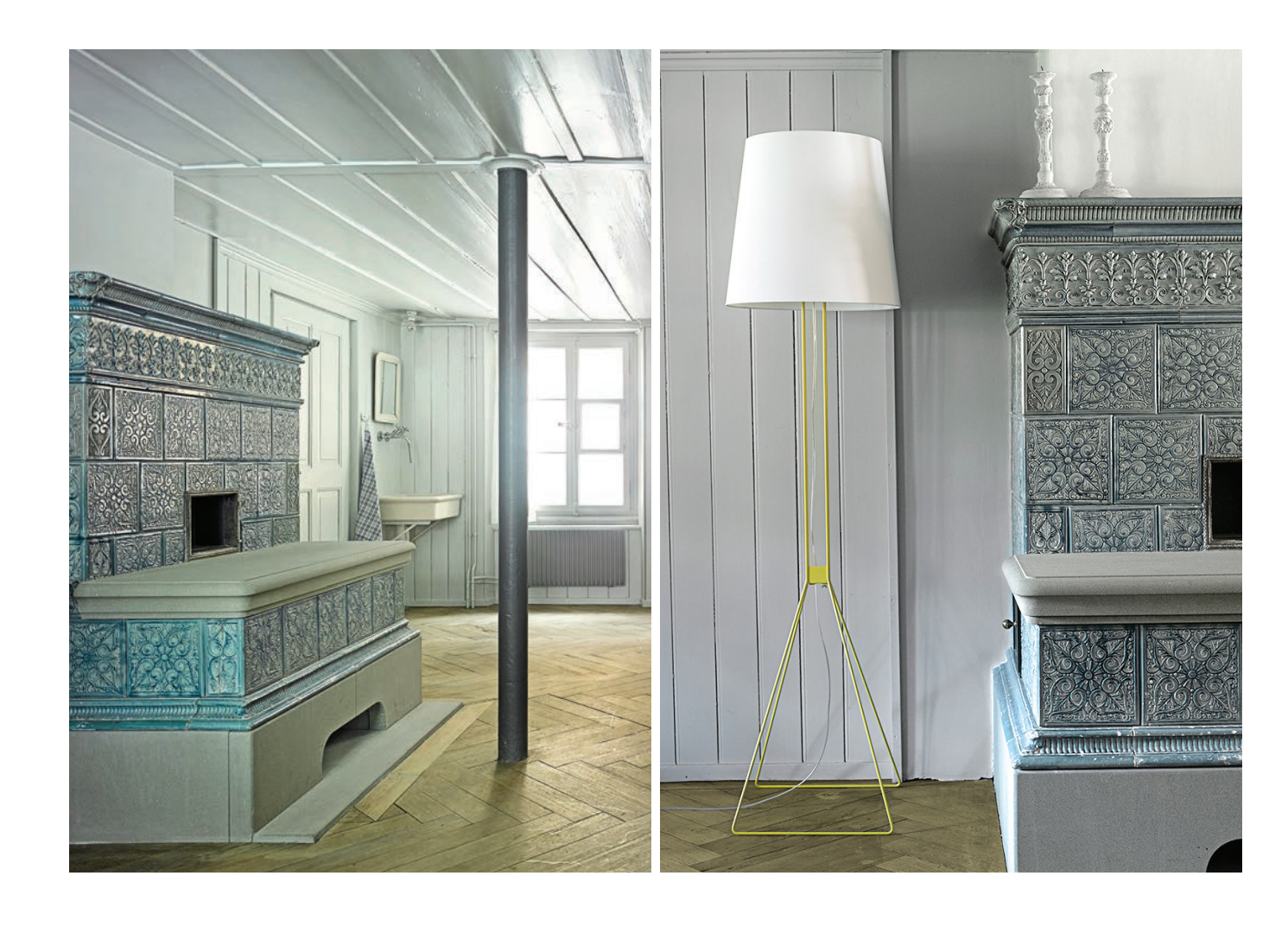
'WE DIDN'T OVER-DECORATE THE ROOMS; WE WANTED TO LEAVE SPACE FOR OTHER PEOPLE'S IMAGINATIONS'